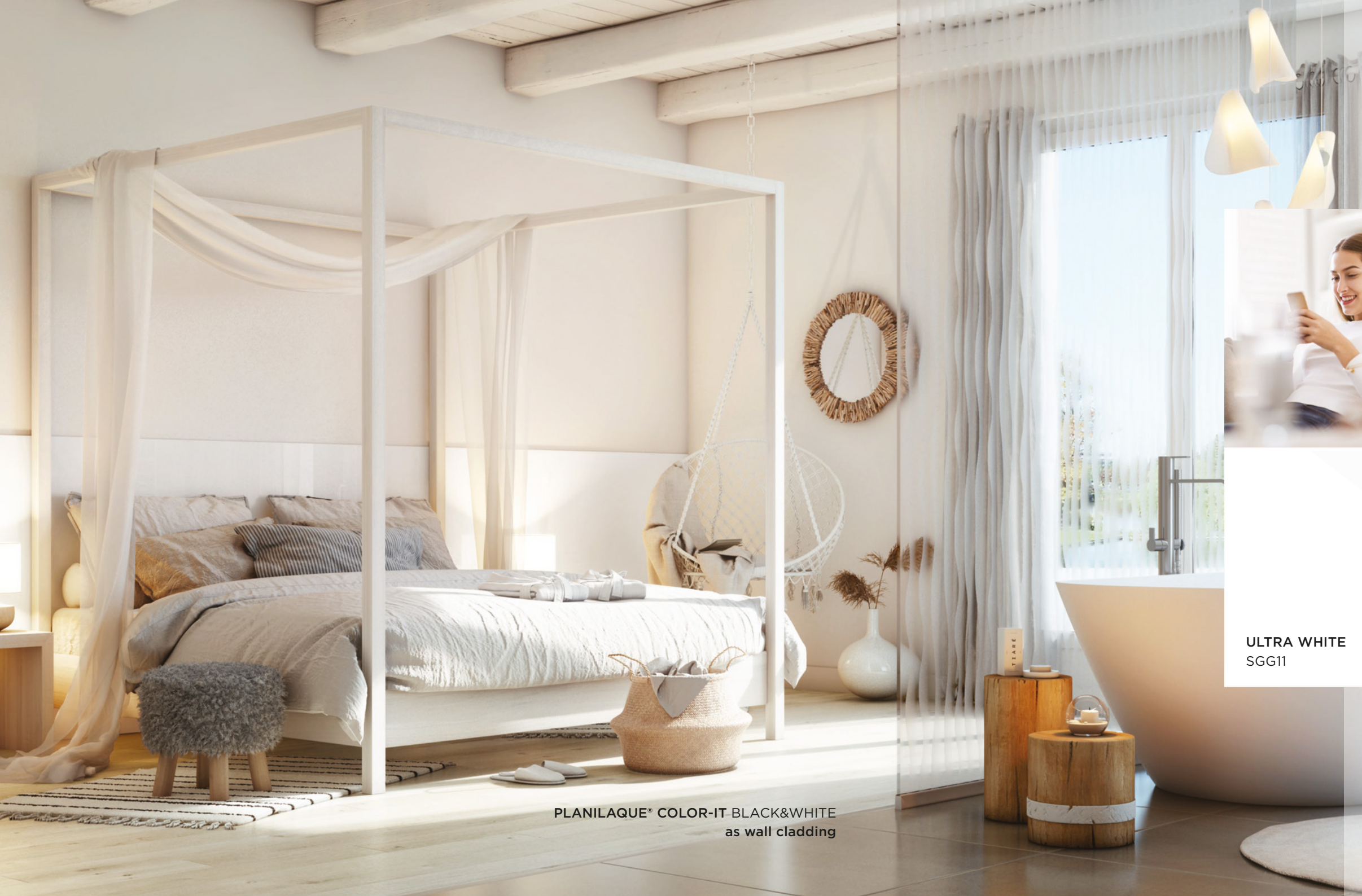
PLANILAQUE® COLOR-IT BLACK&WHITE as wall cladding