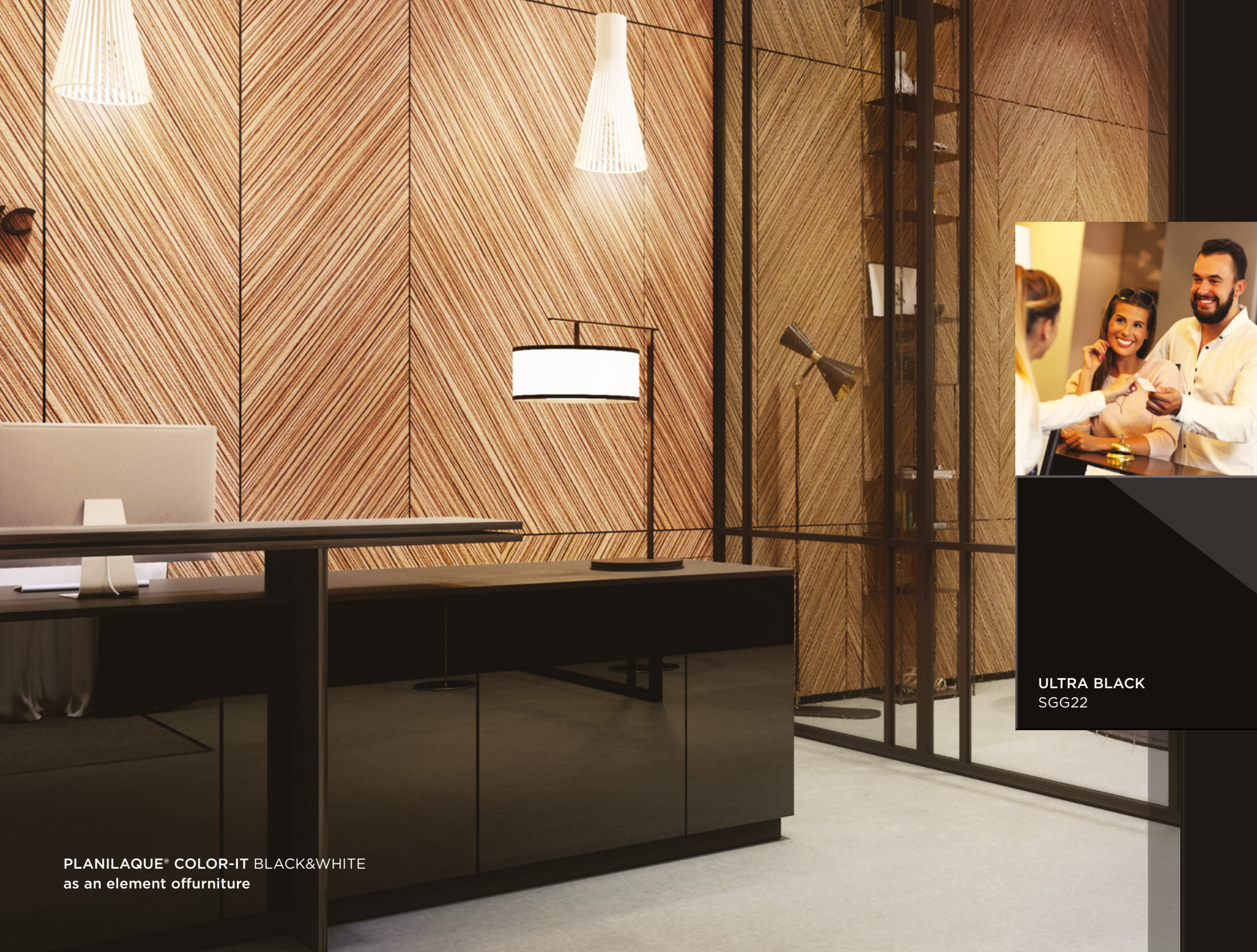
PLANILAQUE® COLOR-IT BLACK&WHITE as an element offurniture