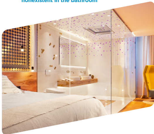
▲ Light more intense in the bathroom than in the bedroom - Espacio GIRA, Guillermo Escobedo - CASA DECOR 2016