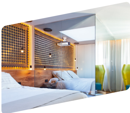
▲ Light more intense in the bedroom and almost nonexistent in the bathroom

This feature is also a great trick to conceal or reveal a room at will, this is why MIRASTAR® is sometimes used as spy mirror.