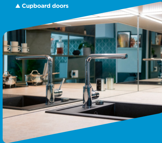
▲ Kitchen splashbacks