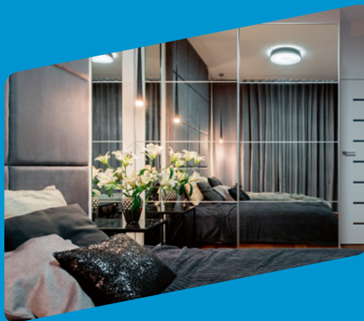
▲ Cupboard doors

MIRASTAR® REFLECT is easy to install on opaque surfaces: glue marks are not visible, thus no lacquering treatment is needed. It is the best choice for kitchen splashbacks and furniture.